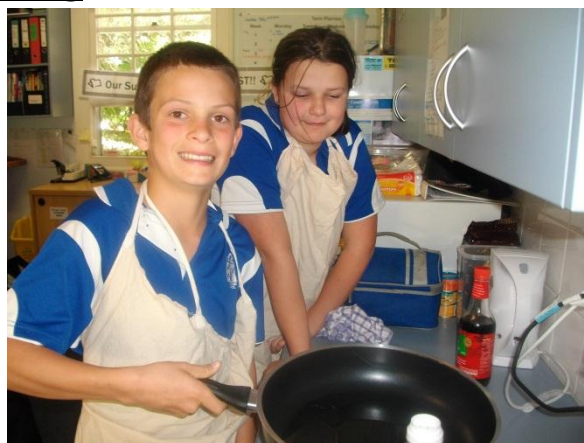
Fried rice was on the menu today.